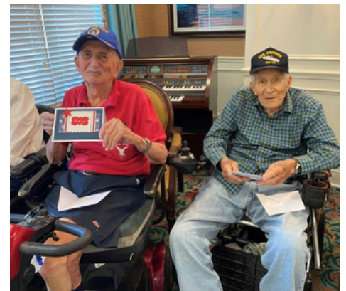
Veterans at Sun Towers receive handmade cards on Memorial Day to thank them for their service.