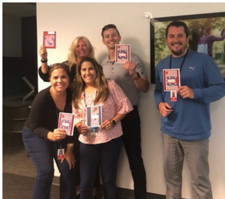
This group of employees at Aetna's Woodland Corporate Park office in Tampa show off the cards of gratitude they wrote for Veterans.