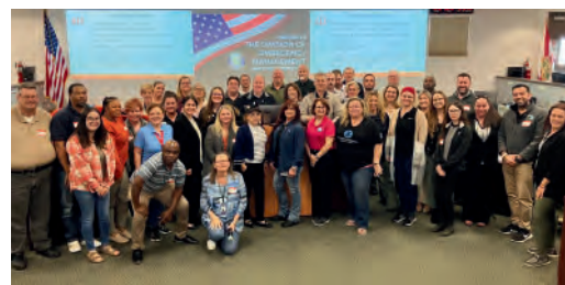
Our Senior Disaster Support team attended the Better Together VOAD Convening in Ocala to connect with experts and ensure we have the knowledge, skills, and resources to help seniors recover from recent hurricanes and be prepared for future disasters.

We've adopted 3 senior communities throughout Pinellas County that were significantly impacted by Hurricanes Helene and Milton. Each month, we host events to bring residents together to share hurricane recovery and preparation resources, enjoy fun activities, and most importantly, build camaraderie so they have someone to lean on before, during, and after a storm.