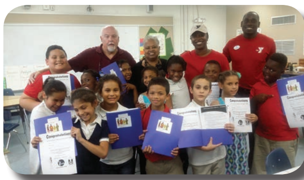
Students at the Sulphur Springs YMCA celebrated their graduation from the CATCH Healthy Habits Program on May 7th.