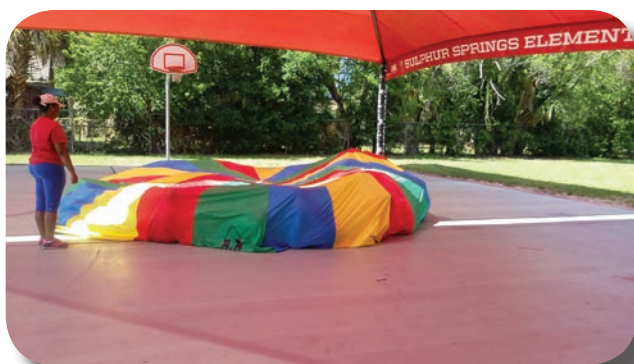
Where's the class? You guessed it - under the parachute!!